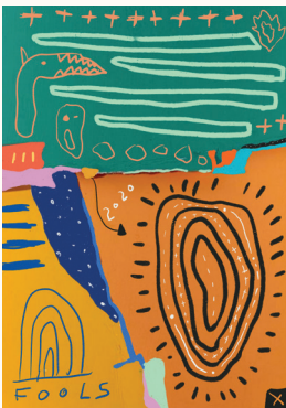
3. Fools Marisa Santosa Enamel Paint, Posca, Acrylic, on Canvas 297 x 420mm, 2023 $570