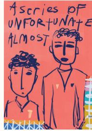
2. A Series of Unfortunate Almost Marisa Santosa Enamel Paint, Posca, Acrylic, on Canvas 210 x 297mm, 2022 $385