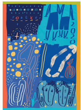
5. Fo ebba ebba ebba Marisa Santosa Enamel Paint, Posca, Acrylic, on Canvas 297 x 420mm, 2023 $570