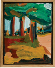
6. Excursion Afternoon Karima Baadilla Acrylic on Canvas Raw oak – Alchemist 200 x 140mm, 2022 $440