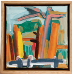
9. I Look Forward to Home Karima Baadilla Oil on Canvas. Tinted oak – Layered Framing 290 x 230mm, 2022 $440