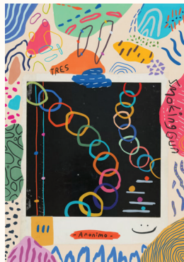
4. Anonimo Marisa Santosa Enamel Paint, Posca, Acrylic, on Canvas 297 x 420mm, 2023 $570