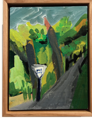
7. Tree Sign Karima Baadilla Acrylic on Canvas Raw oak – Alchemist 200 x 140mm, 2022 $440